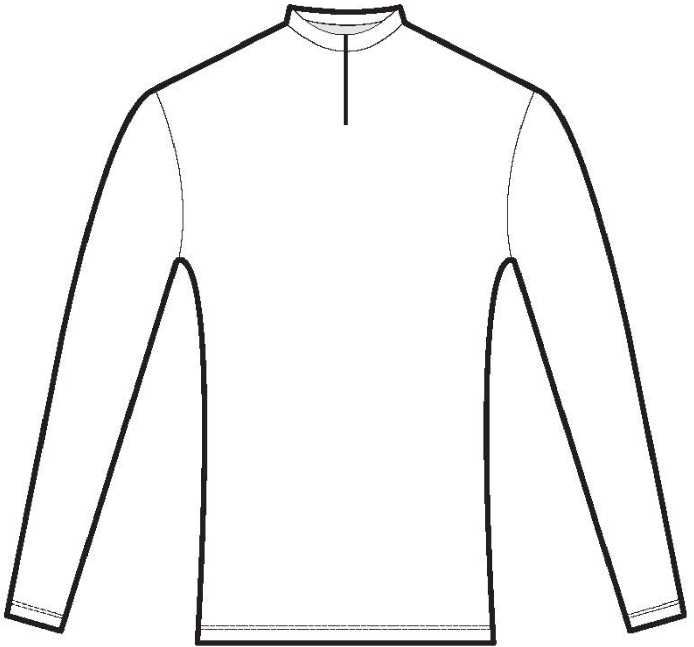
TA QUARTER LS 1/4 ZIP WITH MANDARIN COLLAR